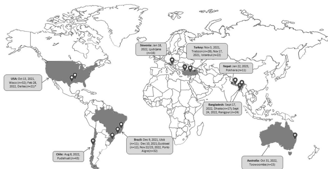
Fig. 2 Map of previous workshop sites considered in the present study

from all previous workshops. This sharing of findings provided a foundation for the subsequent discussions. On day two there were discussions based on Survey 1 results to determine which strategies should be retained for Survey 2. Once these decisions were made, Survey 2 was completed to further refine the strategies. The third and final day centered on discussing the findings from Survey 2 and working towards a consensus on prioritized actions. This collaborative approach allowed for the identification of key strategies for strengthening the resilience of public health systems and communities.